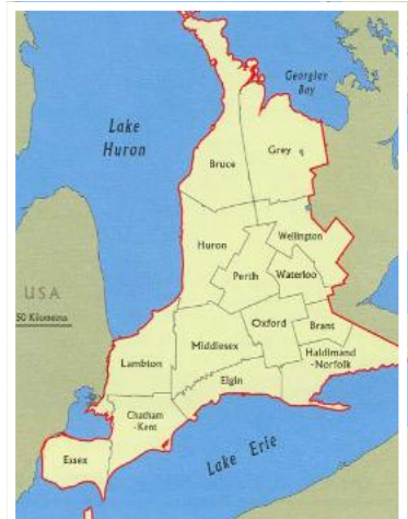
PROPOSED SOUTHWEST REGION