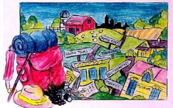
BEYOND THE CITY LIGHTS LOGO